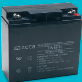
Maintenance free long life battery

By choosing a solar option, these costs are eliminated along with on-going energy bills, initial connection charges and annual connection checks.