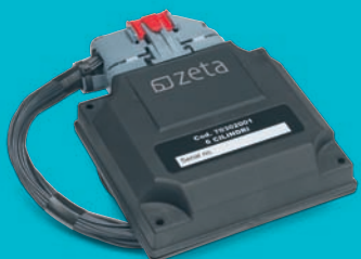
Highly efficient Intelligent controller